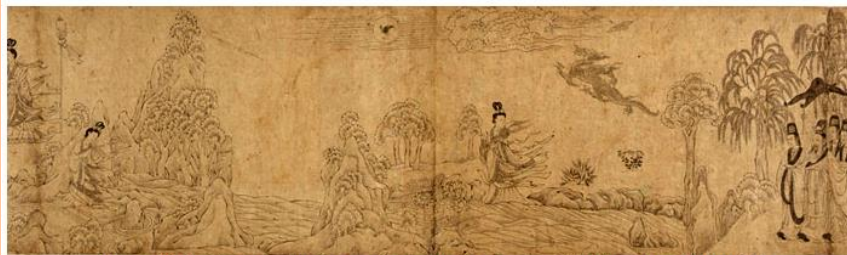
Nymph of the Lo River , an ink drawing on a handscroll, Ming dynasty, 16th century. Freer Gallery of Art

"There is an ancient Chinese legend that goes something like this. Some three thousand years ago, a great flood happened in China. In order to calm the vexed river god, the people made an offering to the river Lo, but he could not be appeased. Each time they made an offering, a turtle would appear from the river. One day a boy noticed marks on the back of the turtle that seemed to represent the numbers 1 to 9. The numbers were arranged in such a way that each line added up to 15. Hence the people understood that their offering was not the right amount.