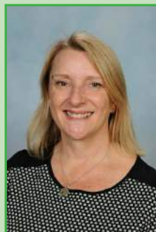
BY MICHELLE GOLDING NBSC Cromer Campus Integrated Studies Head Teacher (Rel)