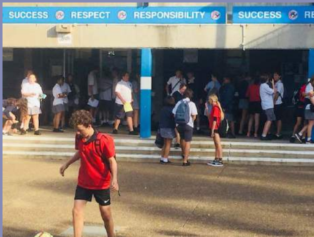
Students assembling for Homework Club after school.