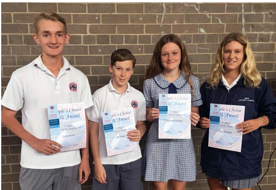
ABOVE: There's nothing wrong with coming second, as their vouchers prove.

See below for the fabulous prizes on offer and our amazing students who won awards.