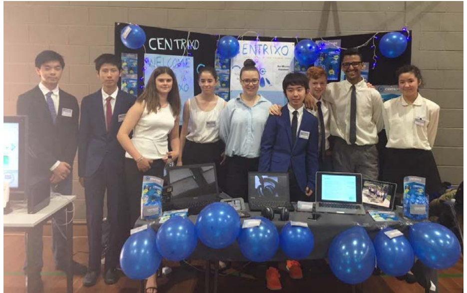
Grand Champions and Best Trade Display

During simulations, the students assumed the key roles of the company's management including a CEO, Marketing Manager, Finance Manager and various other roles while working alongside students from Manly Selective Campus, Balgowlah Boys Campus and Mackellar Girls Campus. Crumer students dominated the experience with our very own students winning awards for "Best Trade Display", "Best Oral Presentation", "Best Simulation" and "GRAND CHAMPIONS".