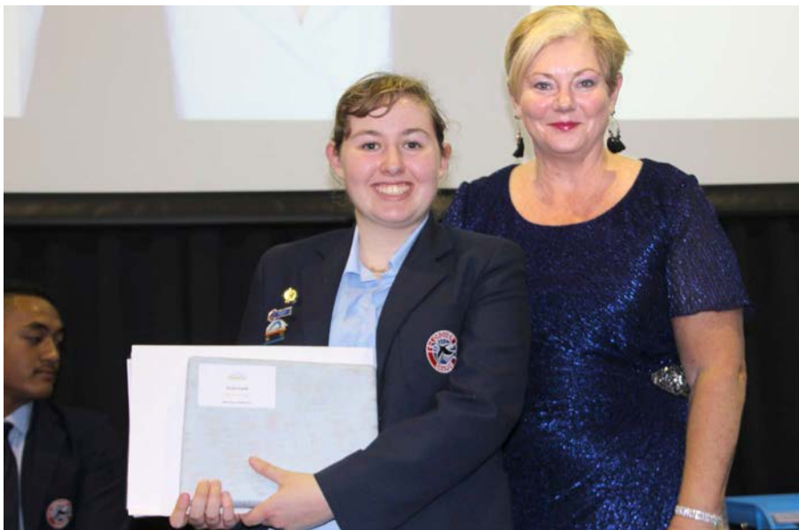
John Hayes Memorial Award Recipient and NBSC Principal (Rel)