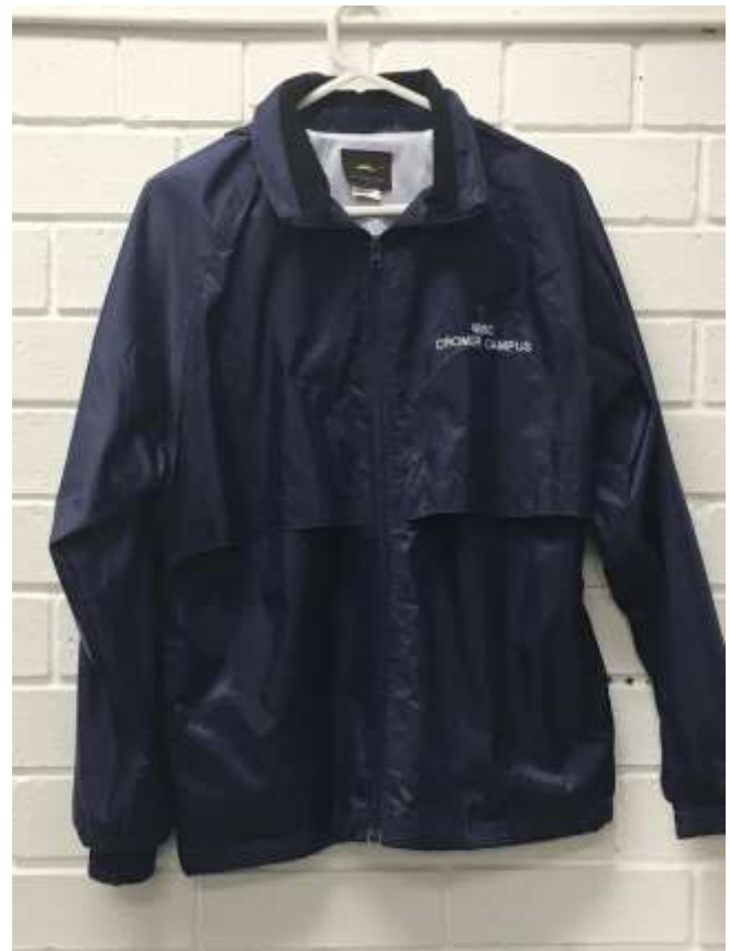
Regular price $60.00