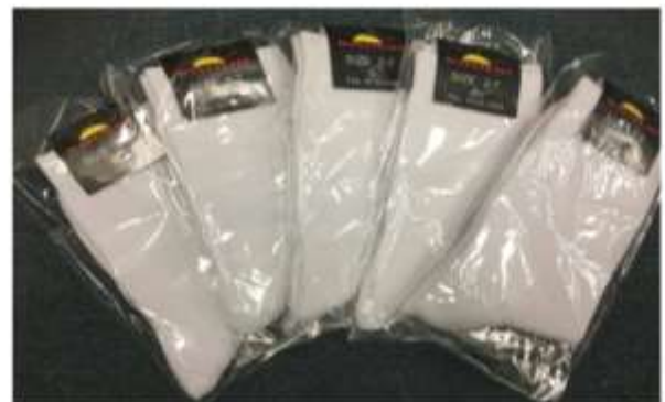
Regular price for 5 pairs $20.00