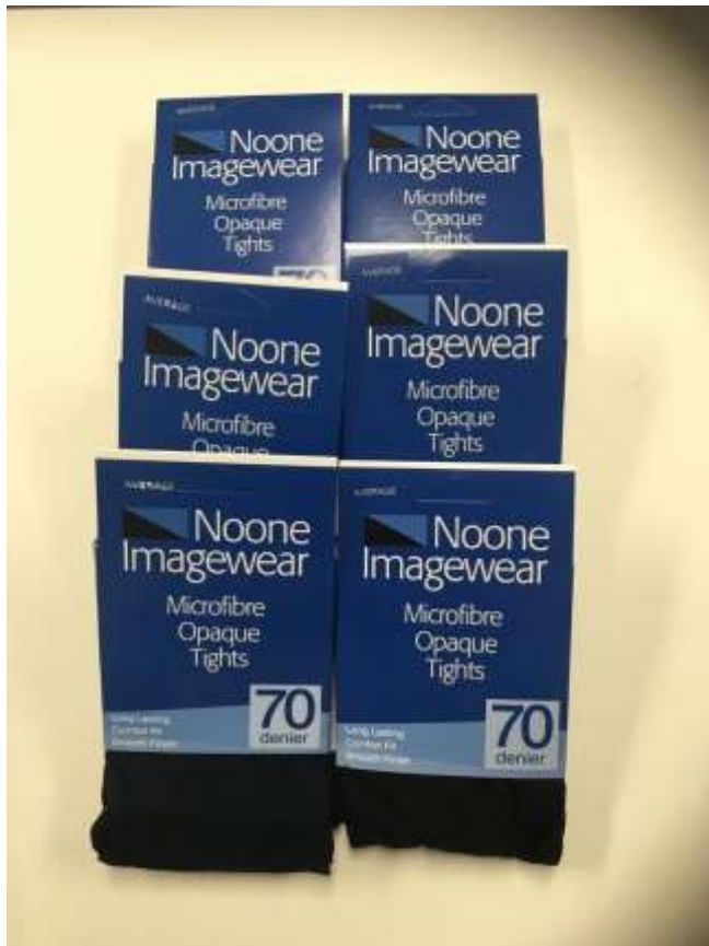
Regular price $10 each available in Black and Navy