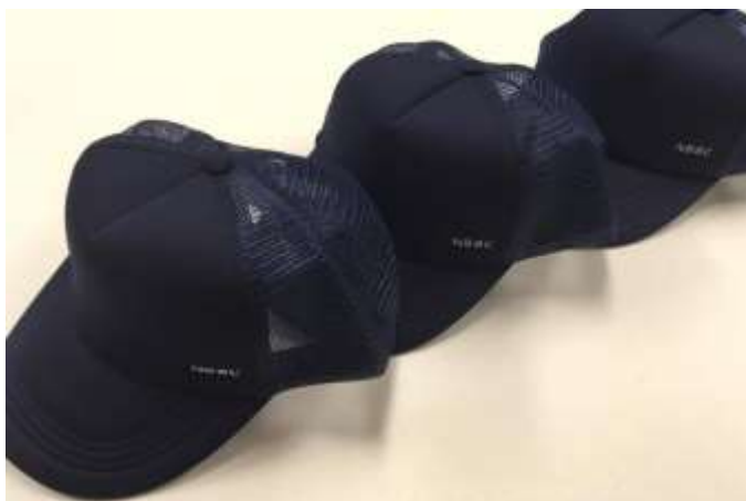
Regular price $12.00