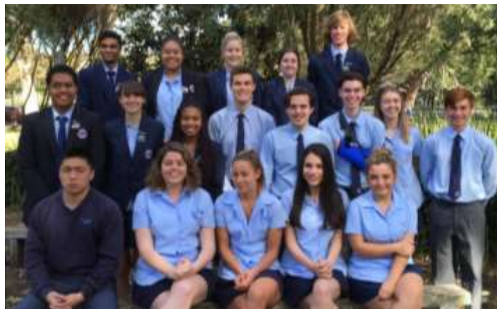
Outgoing and Incoming Student Leaders