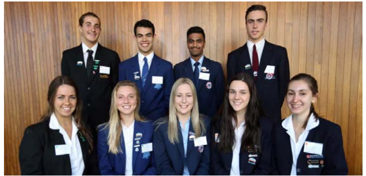
NBSC School Captains – 2015/16 Annual Leadership Conference