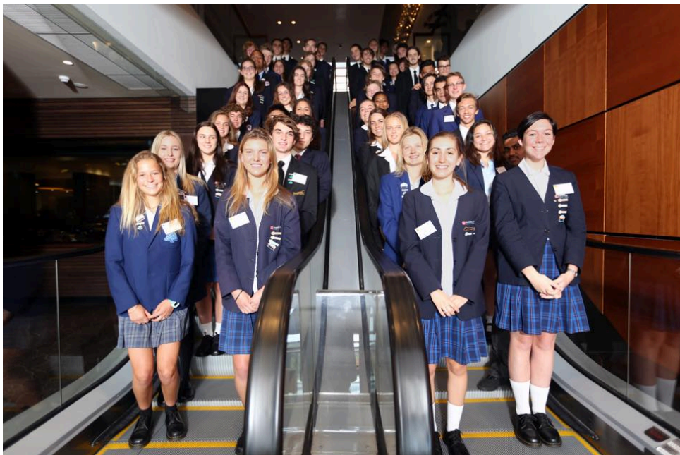
NBSC School Leaders 2015/16