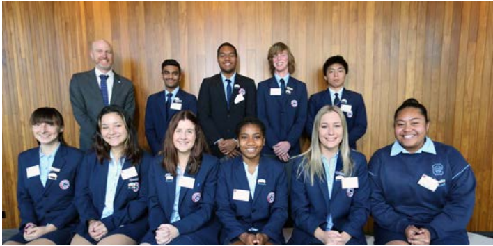
Cromer Campus Leadership Team 2015/16