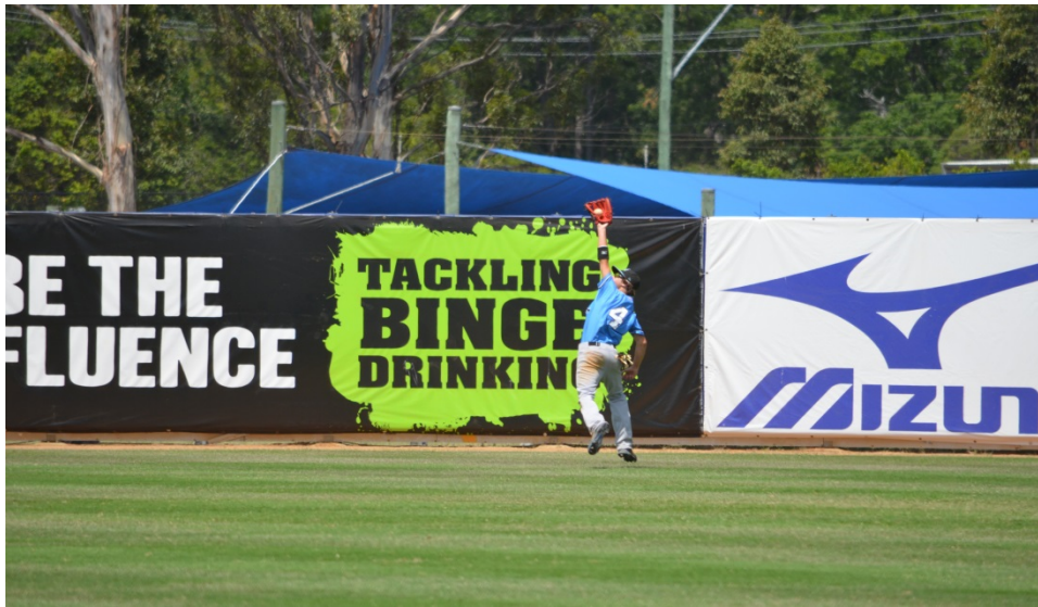
Jack in action at the u16 Nationals