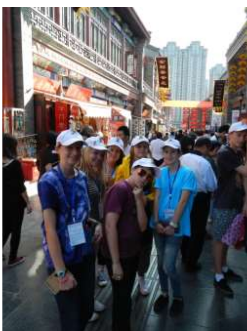
Day 10-11 – Tianjin